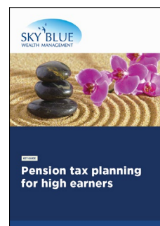
Pensions and tax planning for high earners