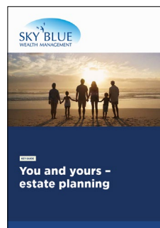
You and yours - estate planning