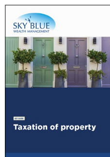
Taxation of property