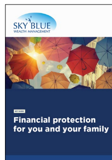
Financial protection for you and your family