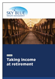
Taking income at retirement