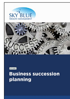
Business succession planning