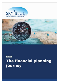
The financial planning journey