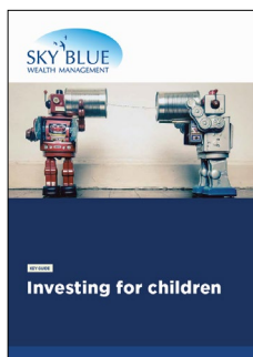
Investing for Children