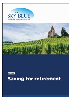
Saving for retirement