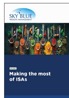
Making the most of ISAs