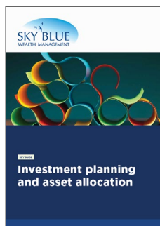
Investment planning and asset allocation