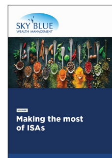
Making the most of ISAs