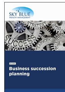
Business succession planning